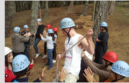
Pacific Leadership Institute