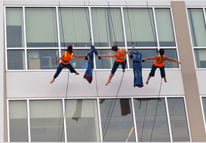
Labor Archives 30 th Anniversary