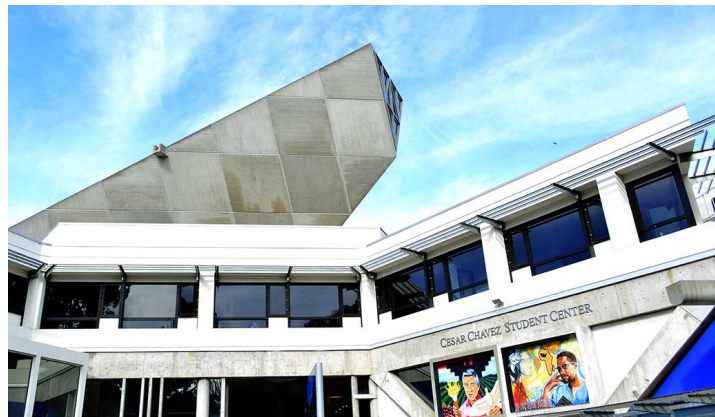
Management of Commercial Leases

UCorp provides administrative expertise to: