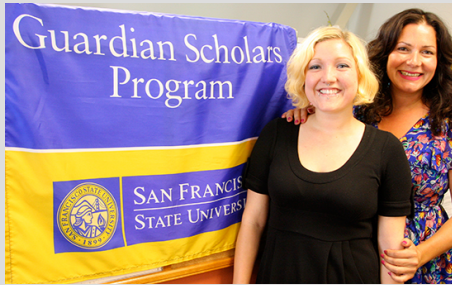
Guardian Scholars Program