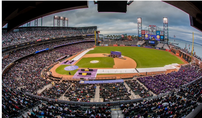
Commencement at AT&T Park