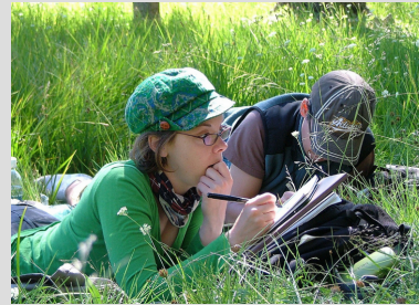
Sierra Nevada Field Campus