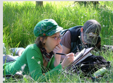
Sierra Nevada Field Campus