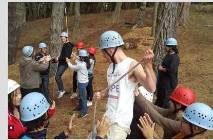
Pacific Leadership Institute