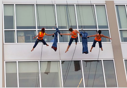
Labor Archives 30 th Anniversary