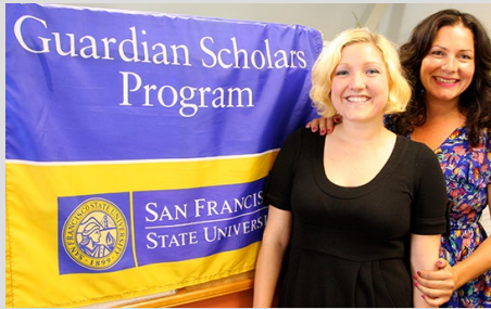
Guardian Scholars Program