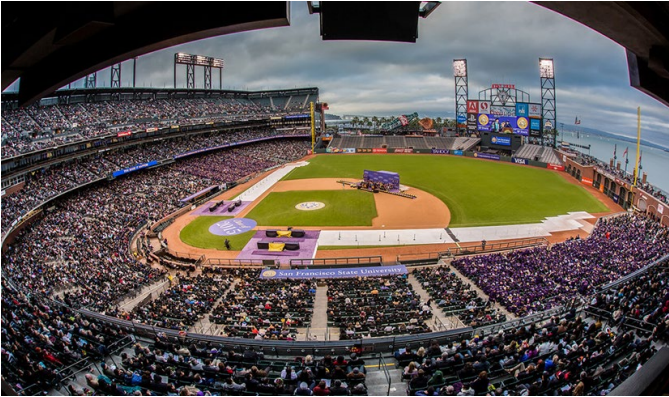
Commencement at AT&T Park