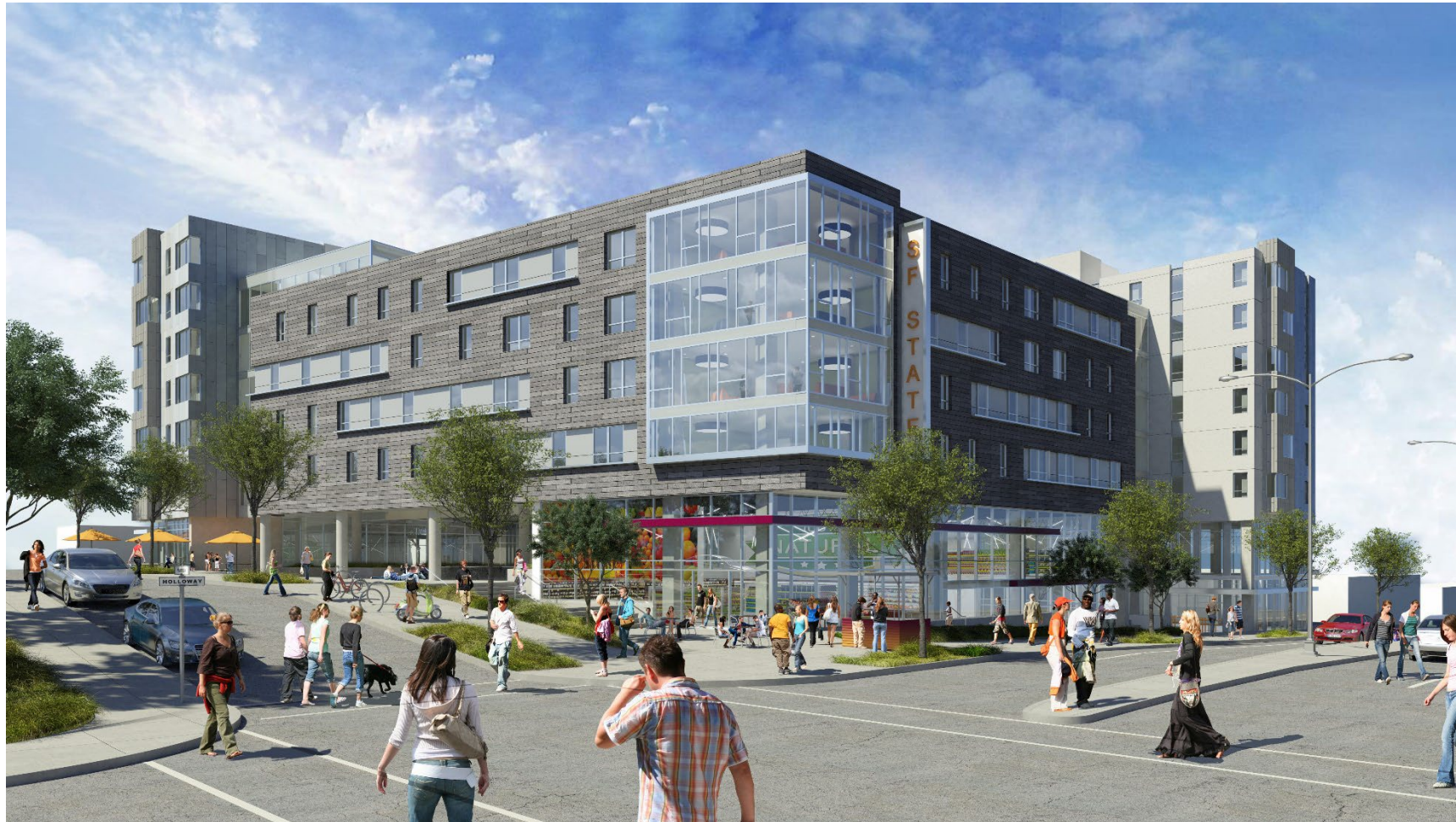
Holloway Revitalization Project