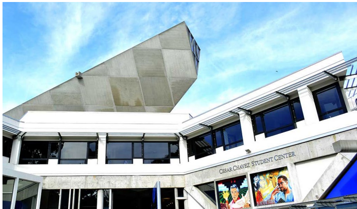
Management of Commercial Leases

UCorp provides administrative expertise to: