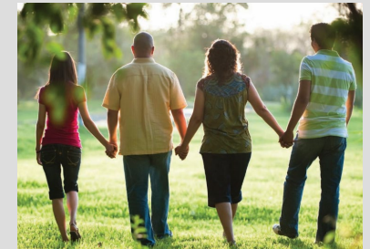
Family Acceptance Program